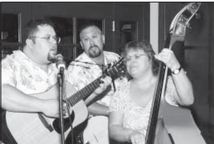
Hurley Ridge donated their time and talent to the auction again this year. Visit them online to say thanks at www.hurleyridge.com or call 502-696-9209.

Proceeds from the Annual Farmland Conservation Auction will support the ongoing operations of the Bluegrass Conservancy. We hope to see you there again next year!!